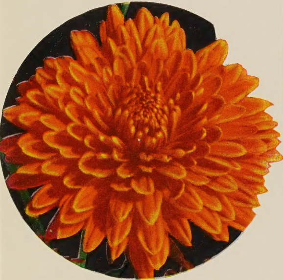
AUTUMN BEAUTY. 50c each; 3 for $1.25